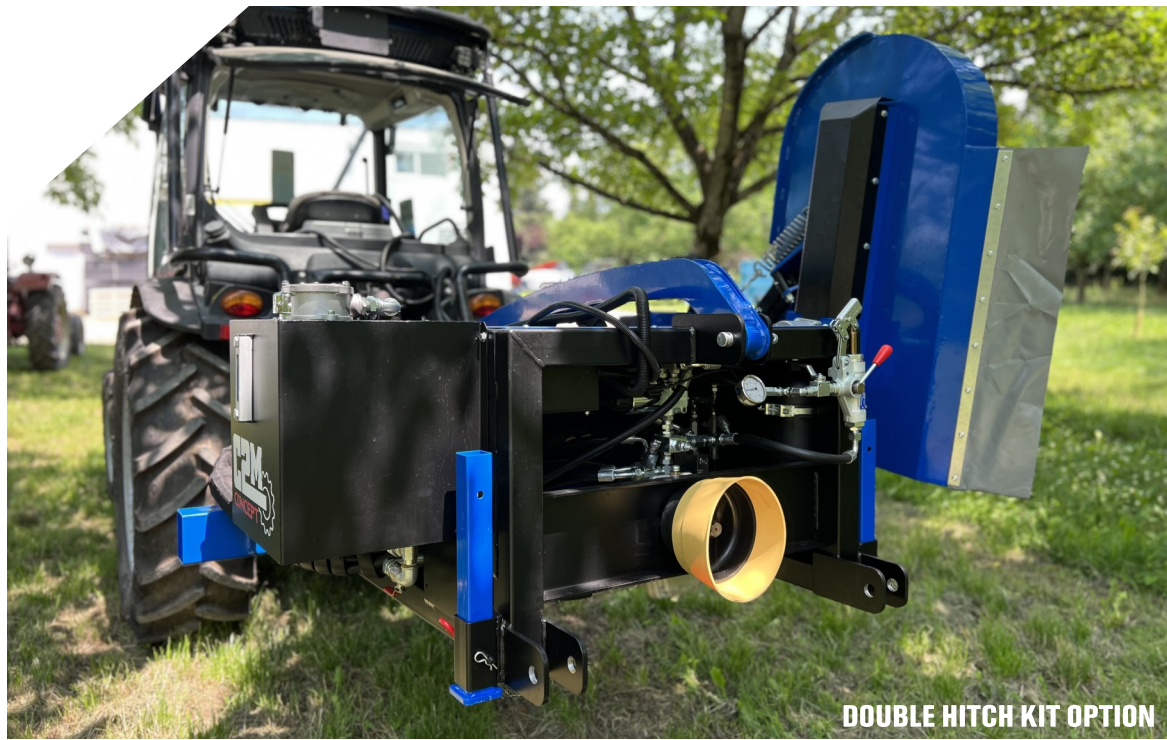
DOUBLE HITCH KIT OPTION