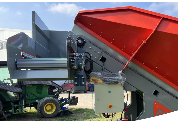
ROLLER DELIMBER AND ELECTRIC BOX