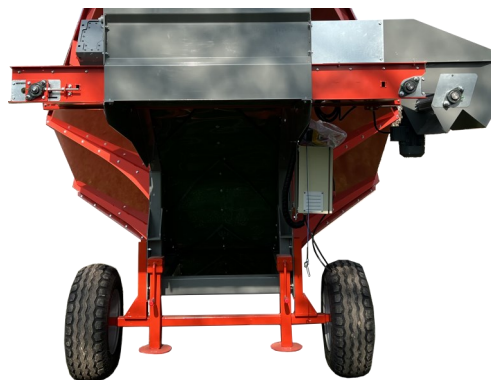
WHEELS AND ADJUSTABLE STANDS